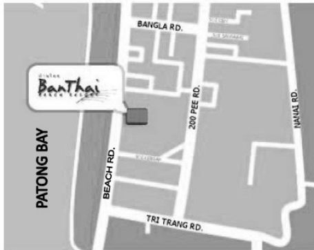
(DOWN SMALL SOI BETWEEN WATSON'S DRUGS AND MCDONALDS)

No pre-registration available. Register at 1,500 Baht with dinner. More details to follow.