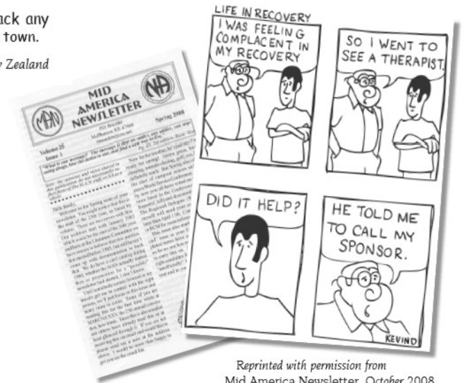
Reprinted with permission from Mid America Newsletter, October 2008